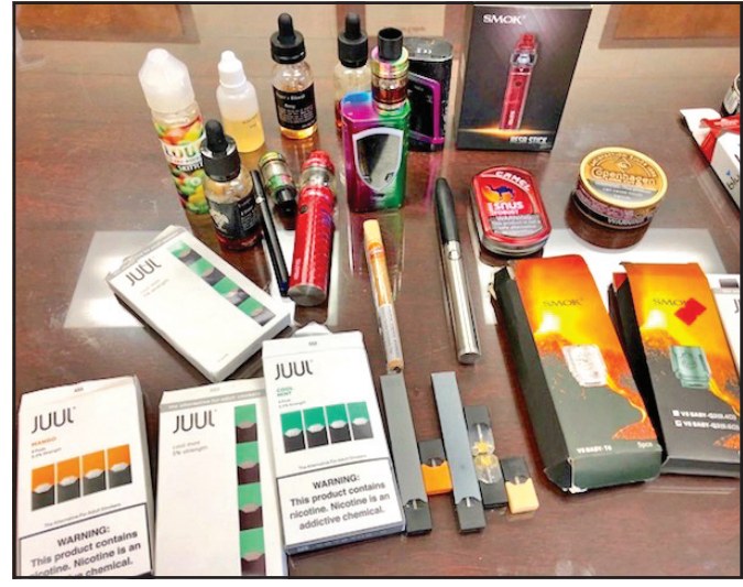
An assortment of e-cigarettes, tobacco products and vaping paraphernalia, including devices and "vape juices," confiscated recently at Union County High School.

Union County Schools See Vaping, Page 6A